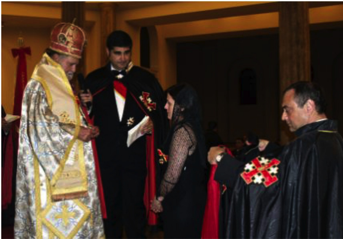
Archbishop Haralambos invests a Dame into the Order of the Holy Sepulchre.