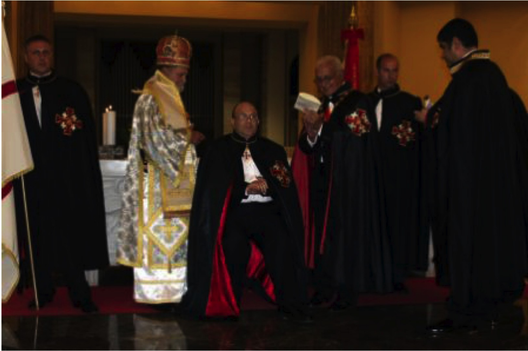
Grand Prelate, Archbishop Haralambos anoints a candidate into the Knighthood of the Holy Order of the O.S.S.