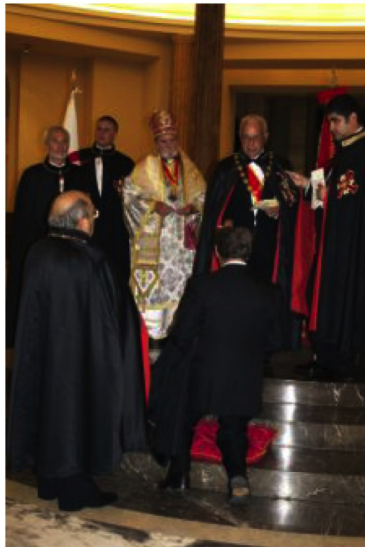
An investiture in progress A Holy Christian Ceremony.