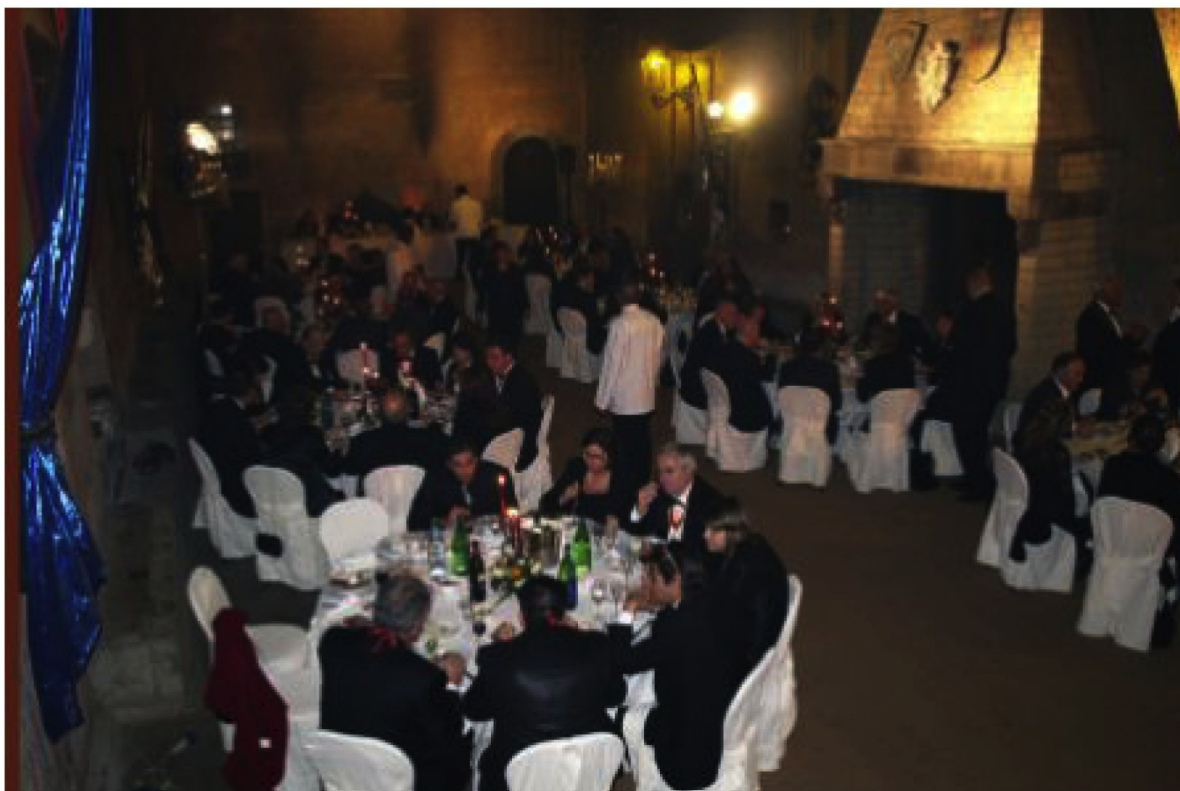
The O. S.S. banquet at the Castello di Lunghezza, a 700-year-old castle in Rome, Italy, followed the investiture.