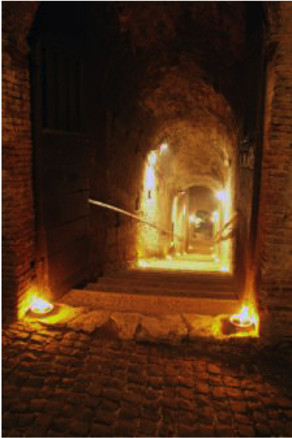
A candle-lit stairway leads to the banquet room at the “Castello di Lunghezza” in Rome.