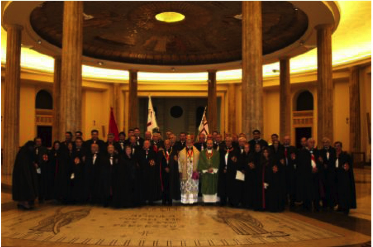
The Majesterium and Knights of Jerusalem O.S.S. are at the Altar at Saint Paul's Cathedral in Rome, Italy.