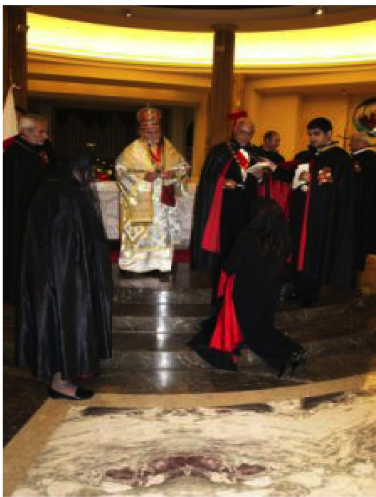
Investiture at the Cathedral of Saint Paul in Rome, Italy.